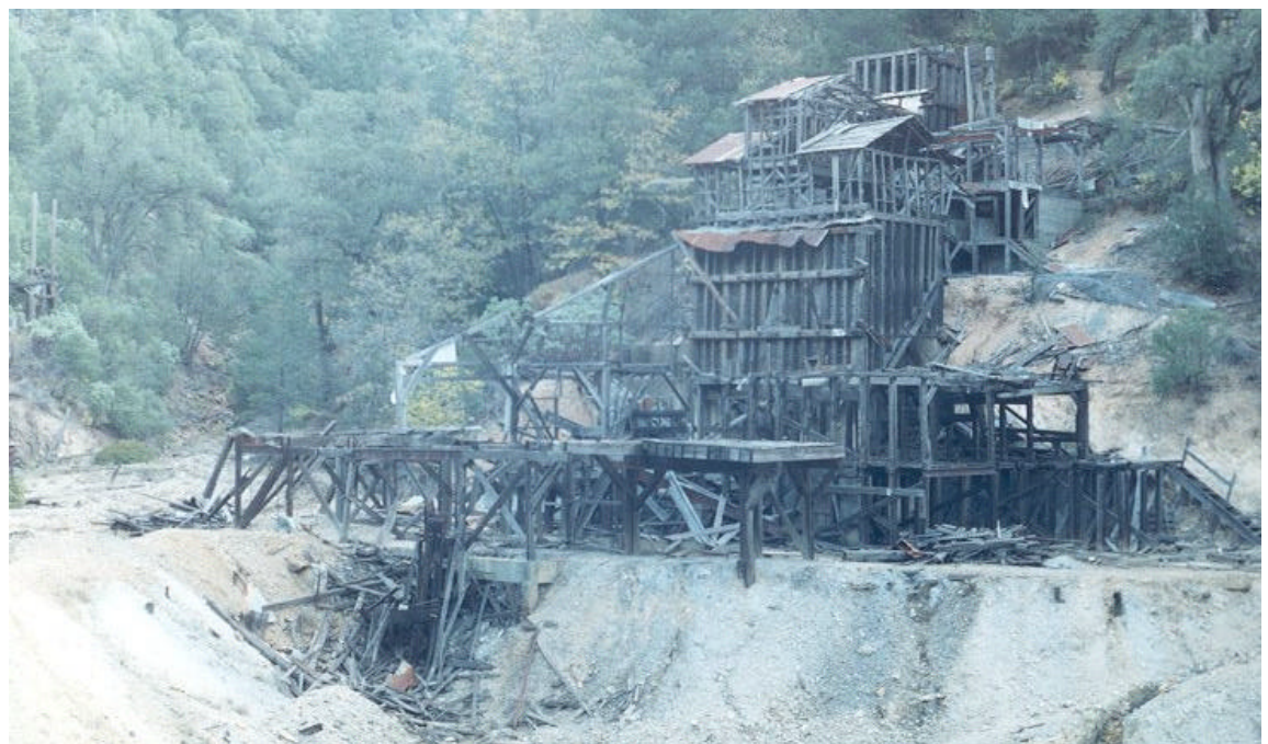
Afterthought Mine, Shasta County — Example of a Derelict Structure.