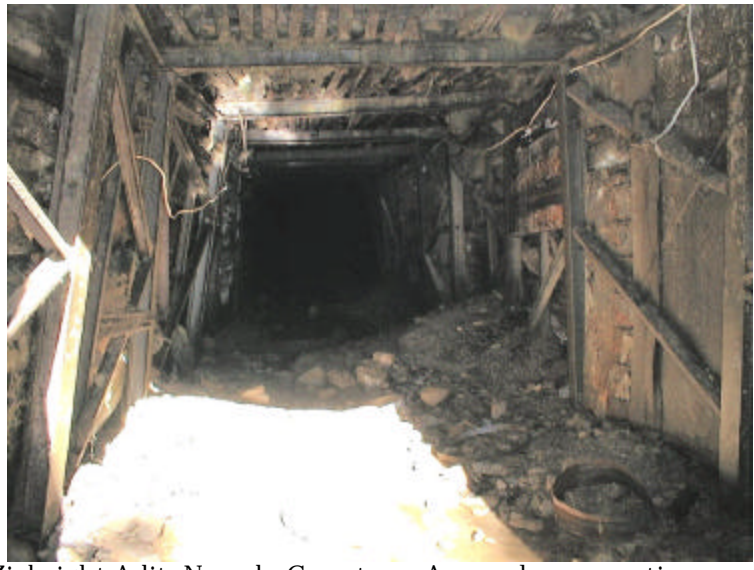
Ziebright Adit, Nevada County — A popular recreation area.

In addition to impacts to water quality, abandoned mine shafts, adits, collapsing structures, and quarry highwalls present grave physical hazards. Though AMLU is currently cataloging these hazards, at present there is no state program or funding mechanism for remediation of physical hazards (chemical hazards can be remediated through actions by potentially responsible parties through CERCLA or CWA actions). A grants program to provide assistance in the preparation of mitigation/closure plans, remediation costing, and contract management, administration, and support for physical hazard remediation on abandoned mines could be initiated.